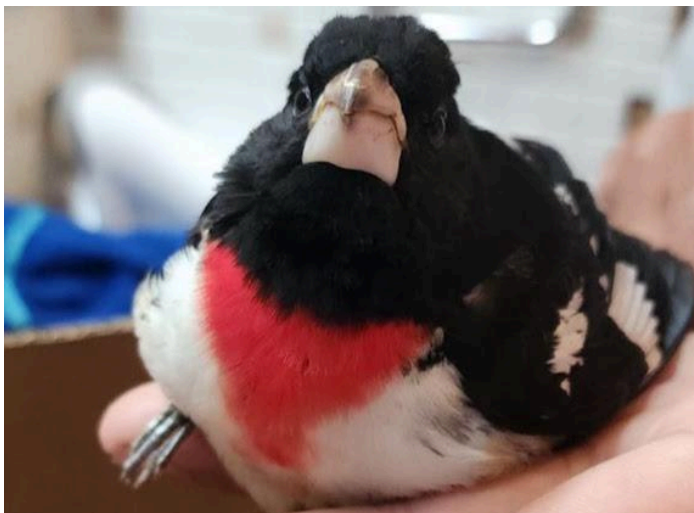
Rose-breasted Grosbeak (male) rescued in Lincoln.

WRT has participated in outreach in Lincoln at their wonderful Earth Day celebration , along with having a table at Patriot Elementary's (Papillion) Family Night and a discussion with Nebraska Extension Educators from several counties. Our outreach helps to spread the word about what WRT does and sometimes we are lucky enough to get some new rehabbers from that interaction!