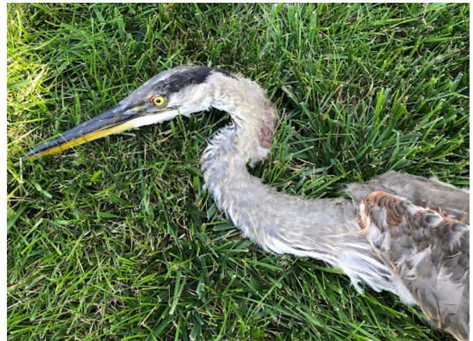
This Great Blue Heron was injured in a recent storm near Fremont.

We have had several Hummingbirds lately. Sometimes they are injured on their migration journey. Sometimes they just need a rest and are able to be released to continue on their way.