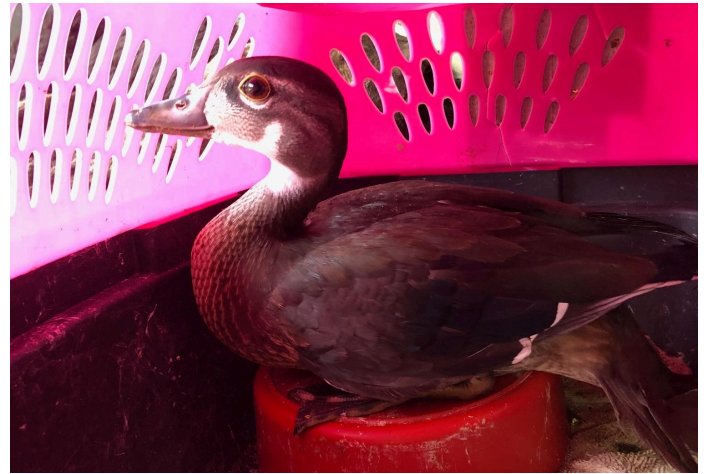
Wood Duck waiting for the kennel door to be opened.